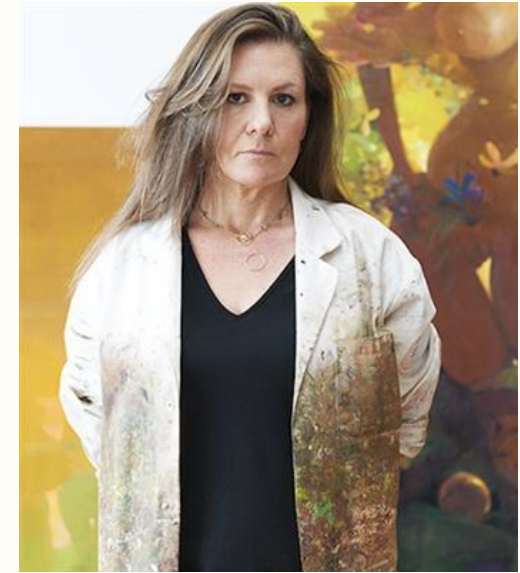
Yuskavage, c. 2017

Read Yuskavage's moving account of supporting a friend through an AIDS diagnosis and related death in the late 1980s and early 1990s. In 2021, the artist contributed a painting to a sale of contemporary art to benefit the New York City AIDS Memorial.