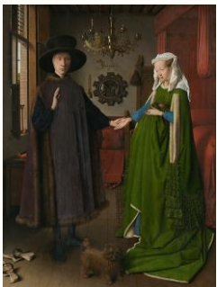
Jan van Eyck The Arnolfini Portrait , 1434 Oil on panel National Gallery, London

Lisa Yuskavage is a figurative painter known for her depictions of fleshy, voluptuous subjects that complicate “the gaze” in the history of painting. Her recent series of works are set in an imagined artist’s studio, using jewel-tone colors to situate her subjects behind-the-scenes in complex compositions. Rendezvous Behind the Artist’s Studio features a nude model posing next to a bowl of fruit in the foreground while a woman dressed in loose clothing sits at a nearby table. The narrative is complicated by the reflection of a photographer in the mirror – an homage to the infamously layered narratives that beguile viewers in paintings by Jan van Eyck (1390-1441) and Diego Velázquez (1599-1660).