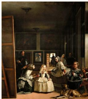
Diego Velázquez Las Meninas , 1656 Oil on canvas Museo Nacional del Prado, Madrid