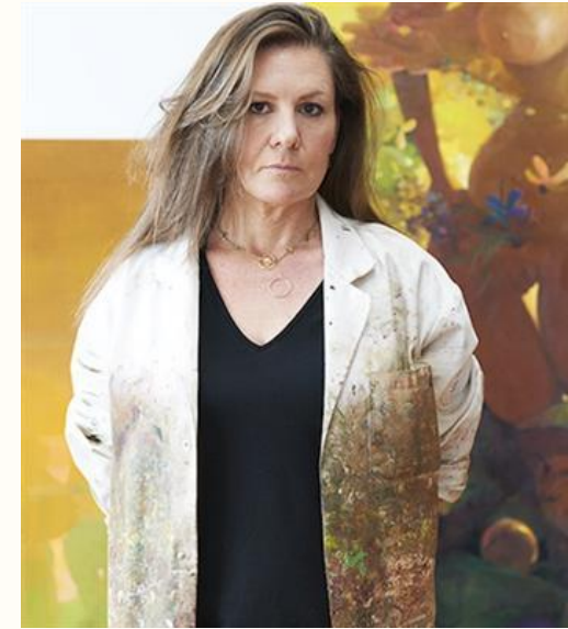
Yuskavage, c. 2017

Read Yuskavage's moving account of supporting a friend through an AIDS diagnosis and related death in the late 1980s and early 1990s. In 2021, the artist contributed a painting to a sale of contemporary art to benefit the New York City AIDS Memorial.