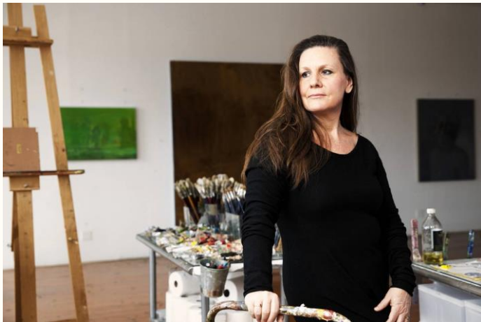
Yuskavage in her studio, 2014