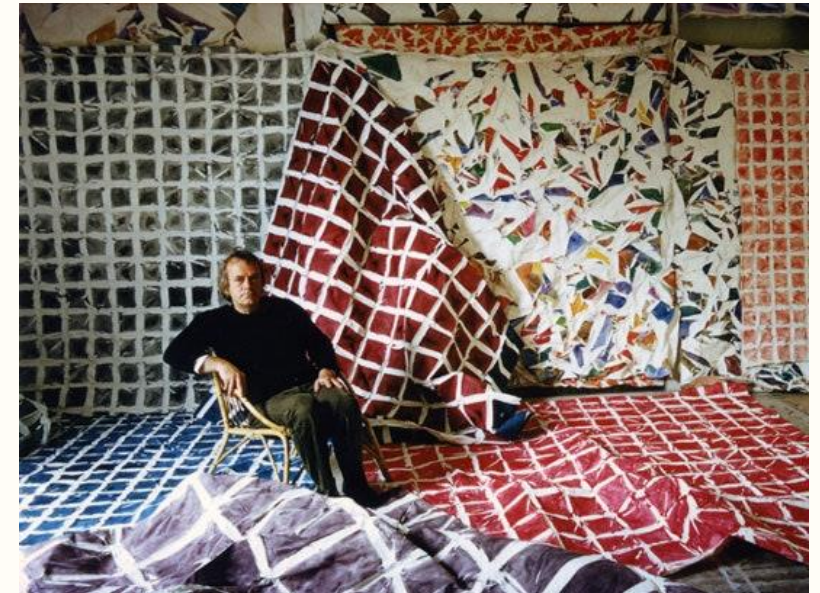
Hantaï in his Paris studio, 1976

In 2024, Simon Hantaï: Azzurro was on display at Gagosian Gallery in Rome. The exhibition focused on the significance of the color blue in the artist's practice.