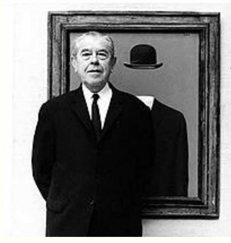
Magritte, 1967