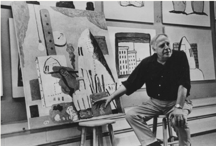
Guston with The Studio (1969), 1969