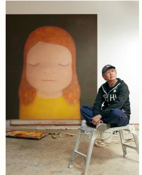
Nara in Tochigi Prefecture studio, 2020

Two major surveys of Nara’s work are scheduled to re-open to visitors in 2021. At Dallas Contemporary , paintings, drawings, and sculptures will trace the artist’s career from 2006. At LACMA , thirty years of work explore Nara’s interests in childhood, music, literature, Europe, Asia, and modern art. A monumental outdoor sculpture and an installation recreating his drawing studio complete the expansive retrospective , which will travel to the Yuz Museum in Shanghai, Guggenheim Bilbao, and Kunsthal Rotterdam. The New York Times Style Magazine: Singapore dropped by his Tohigi Prefecture studio for a lighthearted conversation .