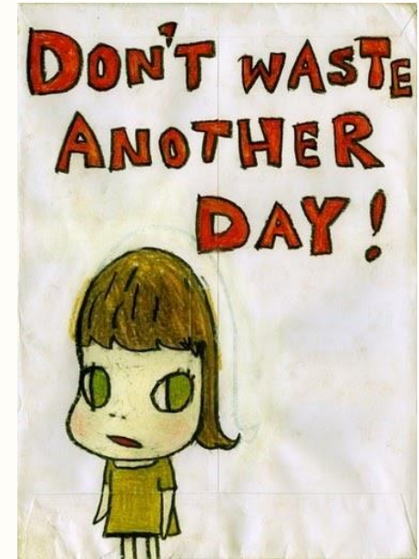
NARA Yoshitomo 奈良美智 (Japanese, b. 1959) Don't Waste Another Day! , 2007 Colored pencil on paper