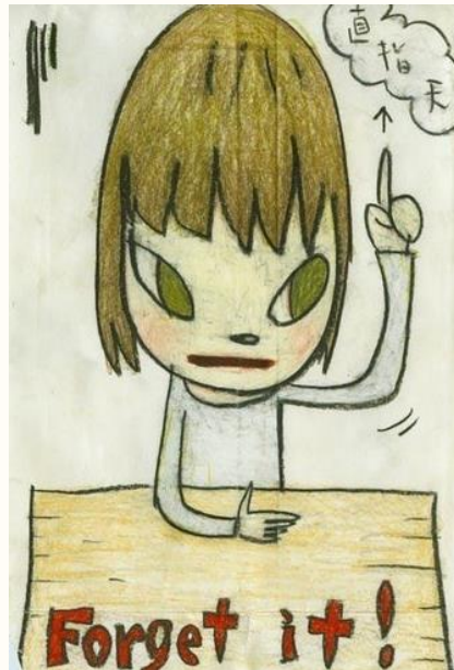
NARA Yoshitomo 奈良美智 (Japanese, b. 1959) Forget it! , 2007 Colored pencil on paper