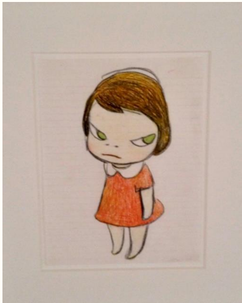
NARA Yoshitomo 奈良美智 (Japanese, b. 1959) Knife Behand Back , 2000 Colored pencil on paper

On view October 7, 2020 – January 10, 2021