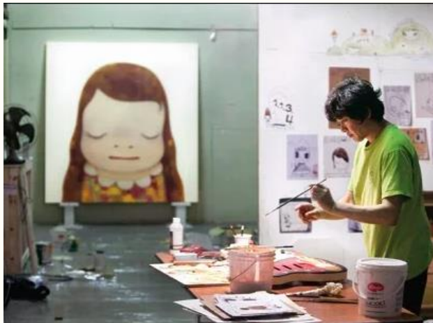
NARA in New York, 2010

Nara’s first solo exhibition in Hong Kong , in 2015, brought together paintings, mixed-media drawings, photographs, and sculptures to capture twenty years of the enigmatic artist’s explorations of interior life. “Instead of capturing one moment or creating something out of temporary emotion, I think I’m trying to create something more permanent in both artistic and aesthetic aspects,” Nara reflected in a video interview .