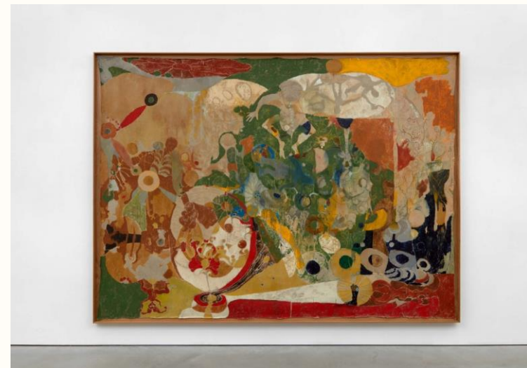
Justin Caguiat, Thousand year old laughter , 2019 Oil on linen Greene Naftali Gallery

Justin Caguiat: Carnival was on view at Greene Naftali in 2022 as the artist's first solo exhibition with the gallery. The exhibition featured Caguiat's myriad sources, "from the flattened forms of manga or woodblock prints to century-old Japanese erotica; the folk-baroque fusions of Filipino Catholic icons to the Vienna Secession's jewel-box modernism."