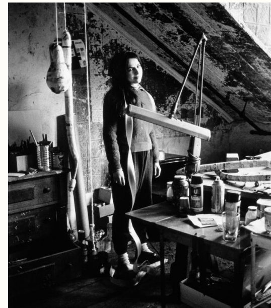
Hesse in her New York studio, 1965

The PBS series American Masters dedicated an episode in 2018 to Hesse’s personal life and career , tracing her early entry into the art world through painting and then sculpture, through interviews with family and friends, and readings from her diaries. “I would like the work to be non-work. To find its way beyond preconceptions. To go beyond what I know, and can know. It is something. It is nothing.”