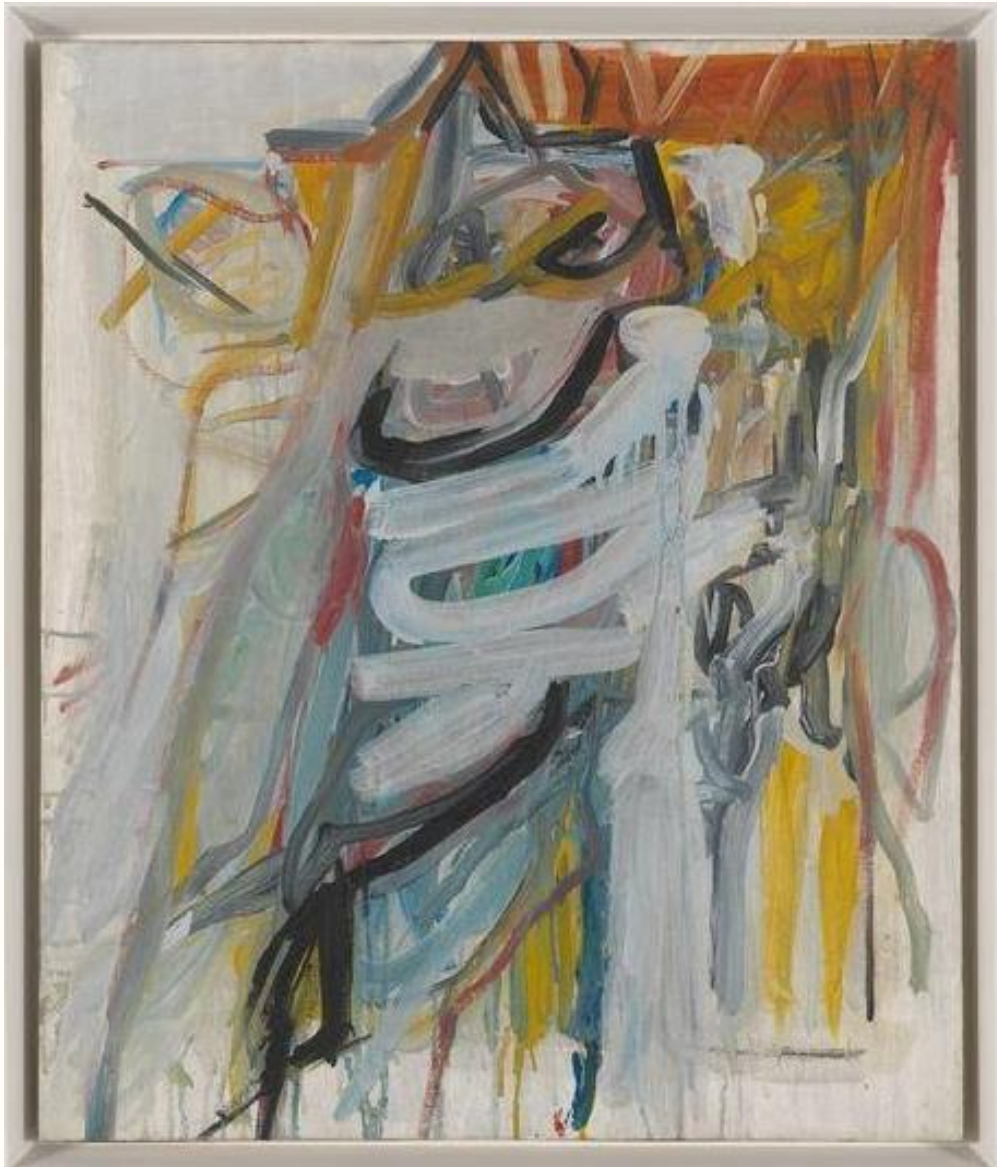
Eva Hesse (American, 1936-1970) No title , ca. 1960 Oil on canvas