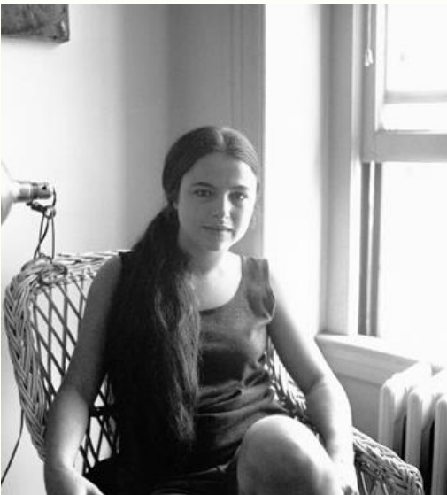
Hesse ca. 1959