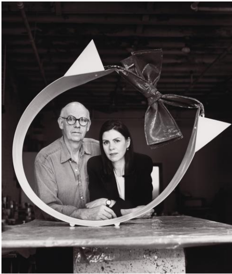
Oldenburg and Coosje van Bruggen (1942-2009) in their studio with Standing Collar with Bow Tie (1992), 1992

Claes Oldenburg: The Sixties brought together 300 pieces of Oldenburg’s early Pop Art works at the Walker Art Center . Watch Oldenburg’s Opening-Day Talk from 2013.