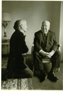
Andy Warhol and Alfred Hitchcock, 1974

Andy Warhol is one of the most influential artists of the 20 th century. Known for his iconic Pop Art style and celebrity status, Warhol was fascinated with fame, consumerism, advertising, and popular culture. His colorful silkscreen portraits often feature celebrities and “superstars,” from Marilyn Monroe and Elvis Presley to Mao Zedong. In 1974, Interview Magazine paired Warhol with infamous film director Alfred Hitchcock for conversation. The two enjoyed a morbid talk about death, murder, and the psychology of serial killers – a fascination the two filmmakers shared. Alfred Hitchcock was produced years later, as Warhol continued to reflect on Hitchcock’s monumental impact on cinema.