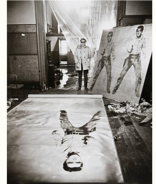
Warhol in New York studio, 1962

Warhol’s enigmatic and stubborn persona received in-depth treatment in a 2020 biography. The author spoke about his 500-page tomb and the nuance of researching the unreliable, mythic, and extremely popular artist.