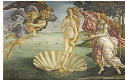
Sandro Botticelli (Italian, 1445-1510) Birth of Venus , ca. 1485 Tempera on canvas The Uffizi

Andy Warhol's Pop Art is known for its reflection on consumerism, celebrity, advertising, and pop culture in the mid-20 th century. However, the artist was also deeply engaged with art history. Details of Renaissance Paintings (Sandro Botticelli, Birth of Venus, 1492) is part of a series Warhol began in 1984 to reinterpret Italian Renaissance masterworks. In Warhol's version, the Botticelli Venus's iconic face and hair are cropped to fill the entire silkscreen. The composition mirrors Warhol's other celebrity portraits, turning the 15 th century Venus into a Pop Art superstar. As the artist once said: "My idea of a good picture is one that's in focus and of a famous person." As with everything Warhol said about his art, his comment contains equal elements of truth and quite deliberate misdirection, all delivered with a wickedly dry sense of humor and irony.