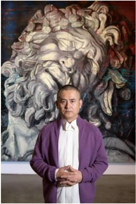
Zeng, ca. 2015

Read a review of Zeng’s 2009 solo exhibition at Acquavella Contemporary Art in Whitehot Magazine.