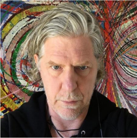
Grotjahn, c. 2020

One of the earliest exhibitions of Grotjahn’s “butterfly” series was at the Whitney Museum of American Art in 2006-2007.