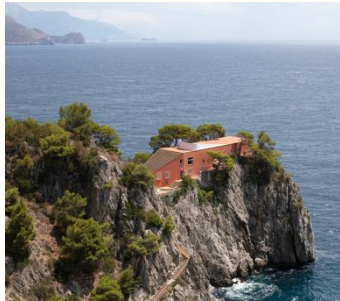
Casa Malaparte, 2019. Detail of photograph

Los Angeles-based artist Mark Grotjahn's early work referenced LA storefront signs and butterfly patterns, often using complex Renaissance techniques of perspective. After a skiing accident in 2008, he turned to the looser, gestural brushstrokes seen in this abstract painting and others by the artist. The "Capri" series began in 2016, when Grotjahn was invited to exhibit at a 1930s home designed by the controversial writer Curzio Malaparte (1898-1957) on the isle of Capri, Italy. The scraped paint of Untitled (Free Capri 50.24) evokes the trees and plants that grow on the island's rocky cliffside. When asked about Casa Malaparte the artist responded: "To me the house is very interesting, because it's rigid, handmade and severe. Just look at the location."