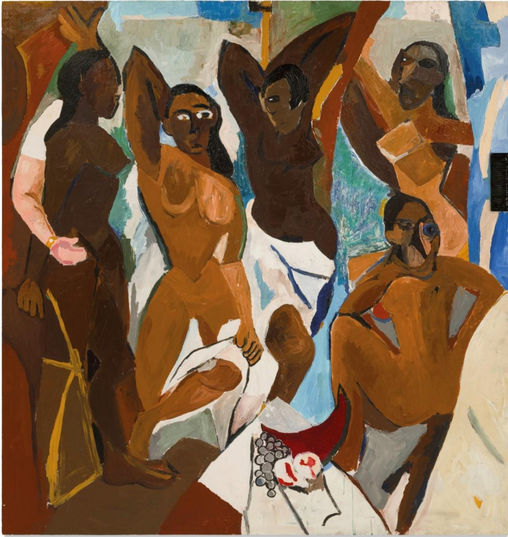
Henry Taylor (American, b. 1958) From Congo to the Capital, and black again , 2007 Acrylic and collage on wood panel