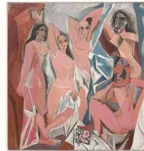
Pablo Picasso Les Femmes d'Alger , 1907 The Museum of Modern Art

American artist Henry Taylor is known for his figurative paintings, but he does not consider himself a portraitist. Instead, he considers his figures as immersed in the social, historical, and cultural narratives of their surroundings. From Congo to the Capital, and black again is Taylor's critique and reinterpretation of Pablo Picasso's Les Femmes d'Alger (1907), which was inspired by what Picasso considered the "primitive" arts of Africa and Oceania. One century later, Taylor confronted the impact of colonialism on the Western art historical canon by painting his own version on a shipping crate when he took a trip to Paris. As Taylor once said: "It's about respect, because I respect these people. It's a two-dimensional surface, but they are really three-dimensional beings."