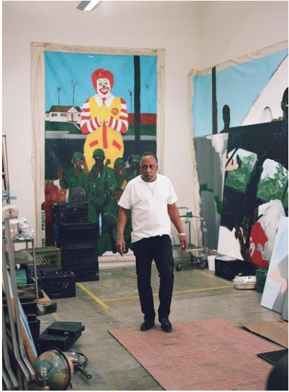
Taylor in his studio, 2017

The Studio Museum in Harlem installed Henry Taylor: Sis and Bra in 2007, the artist’s first major museum exhibition after working as a psychiatric technician and other odd jobs for decades while continuing his painting practice.