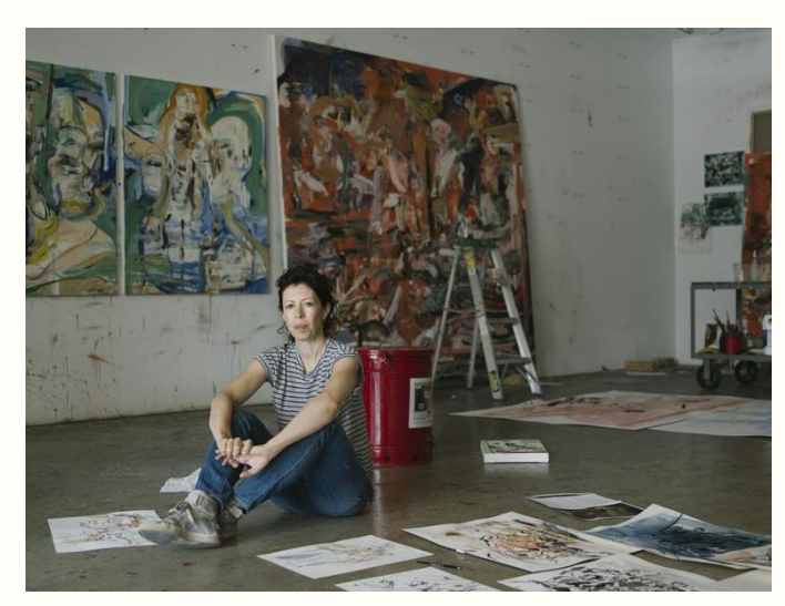
Brown, 2016

"I never think of painting as a cathartic thing, but I definitely think it's a way of processing things...the way I see the world is fragmented. Recently I've been thinking of it more like shattered, everything is splintered," Brown explained in a <u>video profile</u> for the 2018 Louisiana Museum exhibition, Where, When, How Often and with Whom. Brown discussed <u>the triptych</u>, made in 2017 and partially inspired by real world events, for which the show was titled.