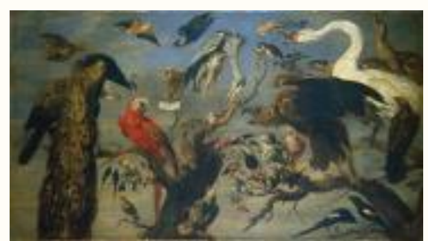
Snyders, Birds Concert , ca. 1630-40 oil on canvas

Cecily Brown's vivid fusions of abstraction and figuration, chaos and stillness, fantasy and reality, nature and flesh are forged from a deep love of painting as a medium and art history as a catalyst for inspiration. Beginning in 2019, she returned to her love of Renaissance masters to execute a series of grand-scale contemporary commentaries on the palettes, genres, and themes explored in seventeenth century works. With its evocative title, The Demon Menagerie takes on a motif known as "concerts of birds," popularized by Flemish painter Frans Snyders (1579-1657), which depict an array of