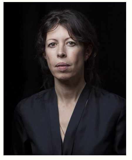
Brown, 2019