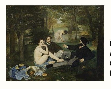
Édouard Manet Le Déjeuner sur l'herbe (Luncheon on the Grass), 1863 Oil on canvas Musée d'Orsay, Paris