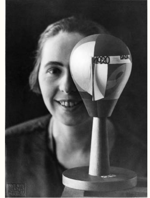
Taeuber-Arp with a Dada Head, 1920

The gallery Hauser & Wirth represents the Taeuber-Arp’s estate. In 2020, it presented an online exhibition of her work. “Challenging conventional boundaries, Sophie Taeuber-Arp asserted art’s relevance to daily life, working across disciplines, from works on paper, painting, textiles, and sculpture, to design and architecture, as well as performance.”