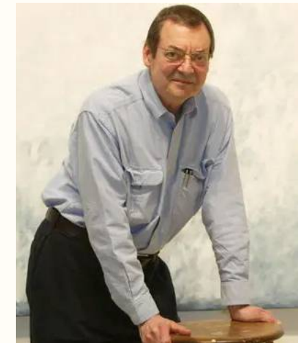
Ryman, 2004

ARTnews and national publications including Apollo Magazine and The Guardian commemorated Ryman’s life and career upon his passing in 2019.