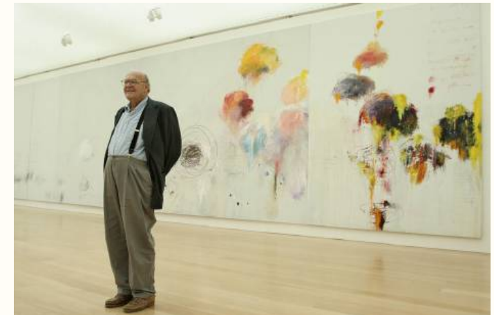
Twombly, 2005

Gagosian Gallery in London presented an exhibition of Twombly's sculptures in 2019 , celebrating the release of volume two of his catalogue raisonné . Twombly began experimenting with sculpture in the 1940s, creating assemblages of plaster, wood, iron, and found materials in his studio, which he frequently painted white – a nod to the marble sculptures of antiquity.