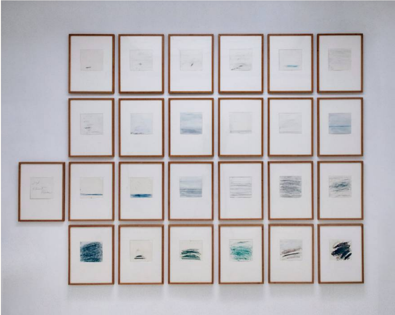
Cy Twombly (American, 1928-2011) 24 Short Pieces, 1973 House paint, crayon, pencil on paper, 25 sheets