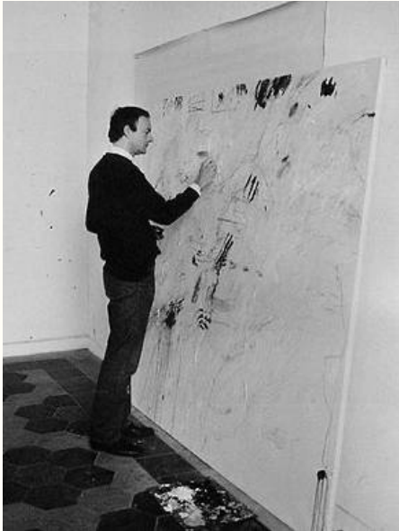
Twombly in Rome studio, 1962