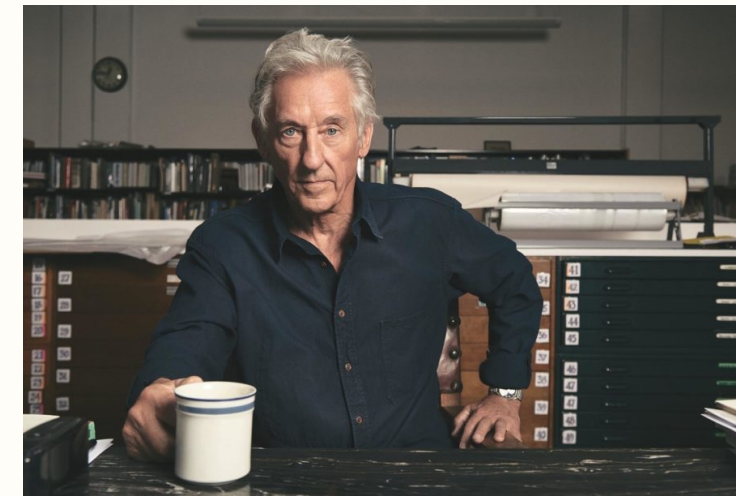
Ruscha, 2018

Oklahoma Contemporary Art will feature Ruscha for his first solo exhibition in his home state in 2021.