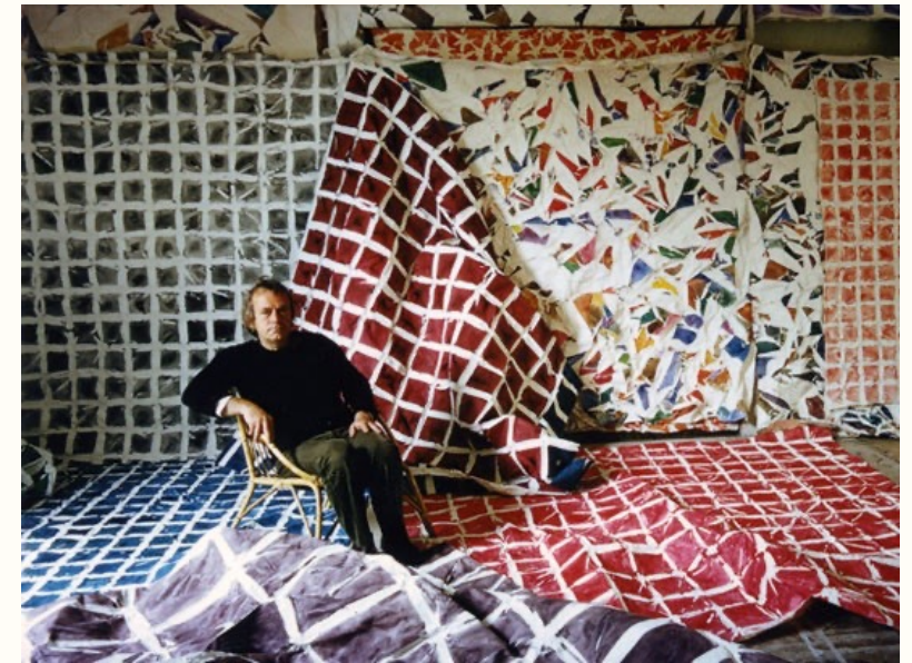
Hantai in his Paris studio, 1976

In 2024, Simon Hantai: Azzurro was on display at Gagosian Gallery in Rome. The exhibition focused on the significance of the color blue in the artist's practice.