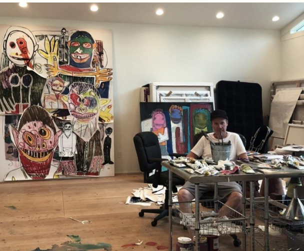
Prince in studio, 2018