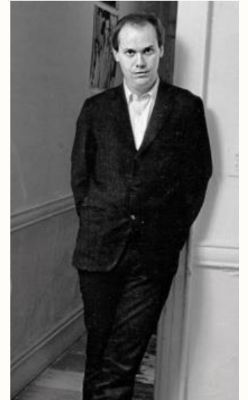
Prince, 1982

Vice joined Prince at his home and studio in 2008 to discuss the artist’s popularity and reputation, current work, and his drive toward the appropriation for which he is celebrated. “For me, a lot of what I think about, you could talk about in terms of this idea of continuation. All it is is something that’s added on to what has been done before me...[It’s] something that you have to give yourself permission to do, someone else can’t do it for you.”