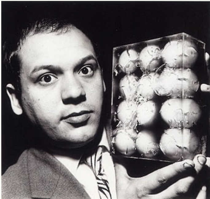
Manzoni, 1960

Manzoni tragically died at the age of 29 from a heart attack in his studio. His impact on contemporary art was not fully realized for decades after his passing. In 1992, Castello di Rivoli-Museo d'Arte Contemporanea held a retrospective. This was followed by one at Serpentine Gallery in London in 1998.