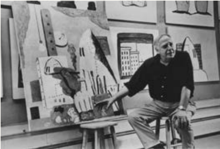
Guston with The Studio (1969), 1969