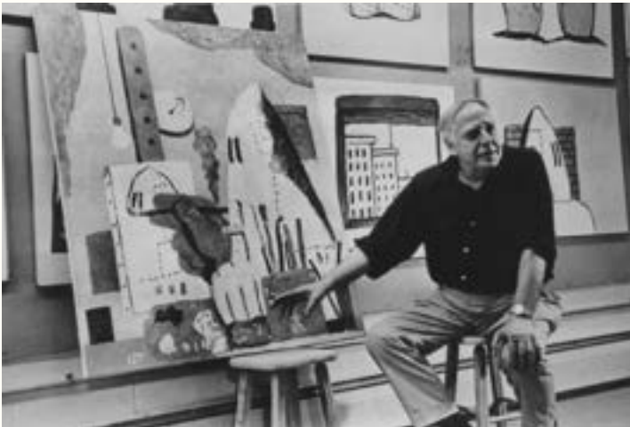
Guston with The Studio (1969), 1969