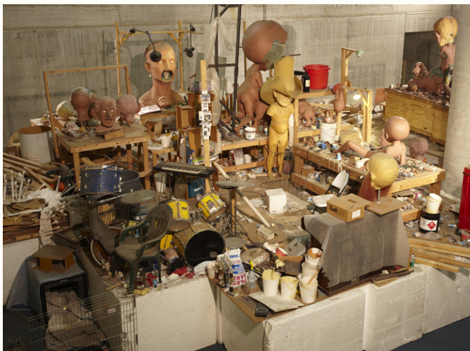
McCarthy's LA studio, installation in process, ca. 2003

Hauser & Wirth's first gallery exhibition for McCarthy in 2017 introduced his grotesque aesthetic with a series of monumental wood sculptures inspired by the German folktale Schneewittchen and its better known animated Disney counterpart, Snow White .