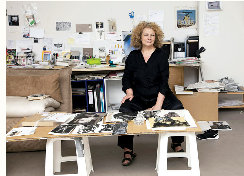
Dumas in her studio office, Amsterdam

Zeno X Gallery in Belgium re-opened in May 2020 with a presentation of Dumas' recent work, including portraits and works inspired by Charles Baudelaire's final collection of poems, Le Spleen de Paris .