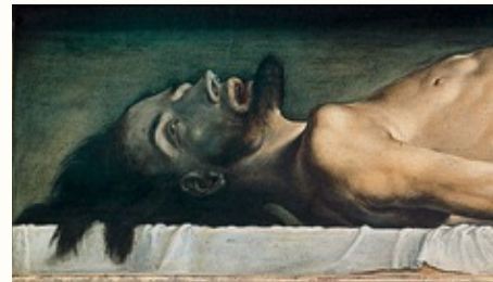
The Body of the Dead Christ in the Tomb , 1521 (detail)

Marlene Dumas has lived and worked in the Netherlands since leaving her birthplace of Cape Town, South Africa in 1976. Dumas is best known for portraits, although the term only narrowly describes her creations. She never works from life, preferring the distance of art historical reproductions and photographs of herself and her family, as well as celebrities, literary icons, artists, and political figures. Seeking out the ambiguity of intense emotions and complex experiences, Dumas renders intangible subjects (death, sex, and shame are favorites) in figurative form. Like Don Quixote takes its pale profile from German Renaissance painter Hans Holbein's life-size The Body of the Dead Christ in the Tomb (1521). Removed from its original context and given the suggestive simile of a title, the anonymous face glows with a ghostly hue created by thinned layers of paint: a mask of insubstantial flesh that provides no reassurance of identity, time, or place.