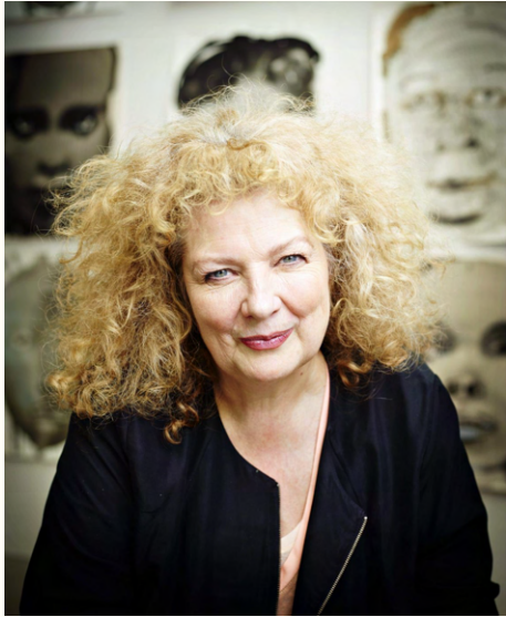
Dumas, 2014

In 2014, Dumas participated in Manifesta 10 , a contemporary art biennial at the Hermitage Museum in St. Petersburg, Russia. She mounted her series, Great Men , 16 portraits of gay men, in an act of protest against the nation's anti-gay legislation. In a poem conceived for the exhibition, Dumas wrote: "Art is there to help us to see more and not less / Laws are there to help us to love more and not less / Laws should protect us from hatred and not from love." Watch Dumas talk with the Tate Modern about the series.