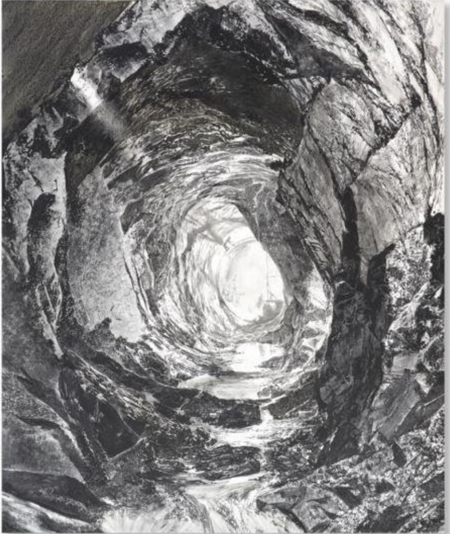
Mark Tansey (American, b. 1949) Study on "Installing the Lens" , 2000 Mixed media on canvas