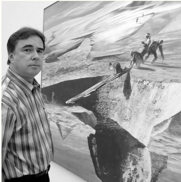
Tansey, unknown date

In 2005, Mark Tansey was the artist’s first solo exhibition in Germany, held at the Museum Kurhaus Kleve . The exhibition then traveled to Württembergischer Kunstverein in Stuttgart.