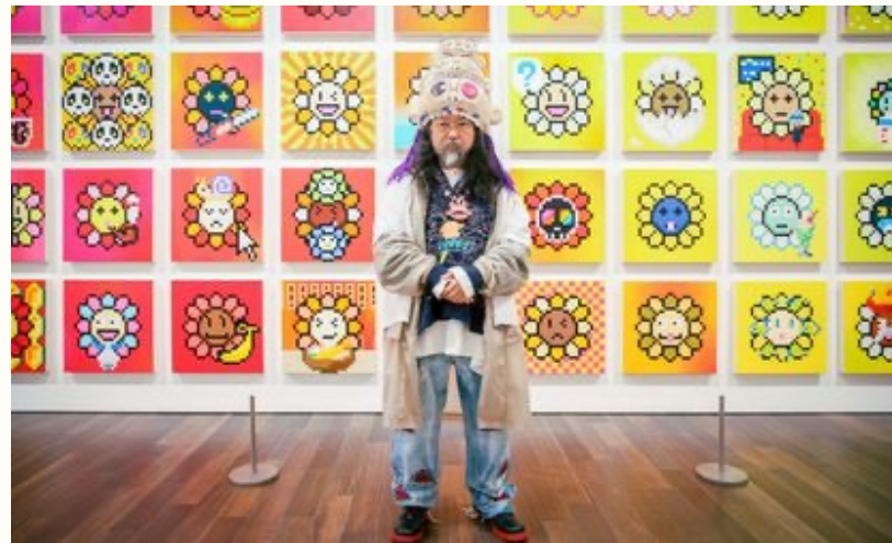
Murakami in San Francisco, 2023

In 2017, The MFA Boston launched Takashi Murakami: Lineage of Eccentrics, a Collaboration with Nobuo Tsuji and the Museum of Fine Arts, Boston . The project and exhibition created a dialogue between Murakami and the famed art historian, Nobuo Tsuji, who put Murakami's work in conversation with Japanese masterpieces from the MFA's collection. Read a review in the Boston Globe calling it: "Fun, fun, fun."