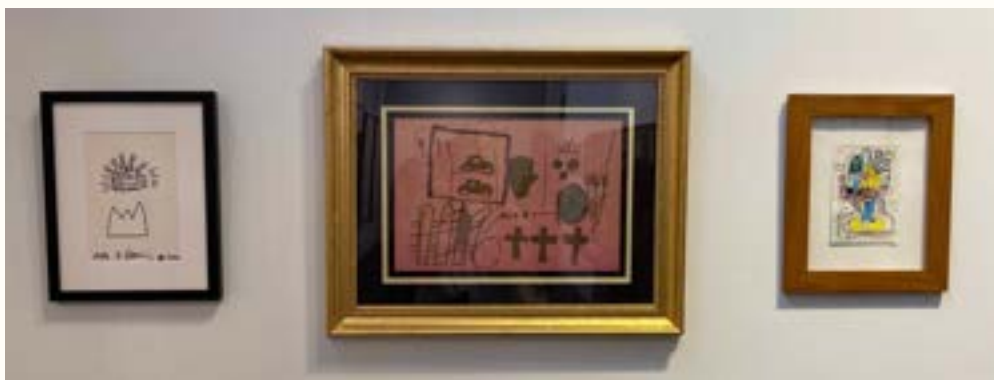
On display with Jean-Michel Basquiat, Untitled , 1980 and George Condo, George Imitating Basquiat , 1989

On view December 8, 2021 – March 13, 2022