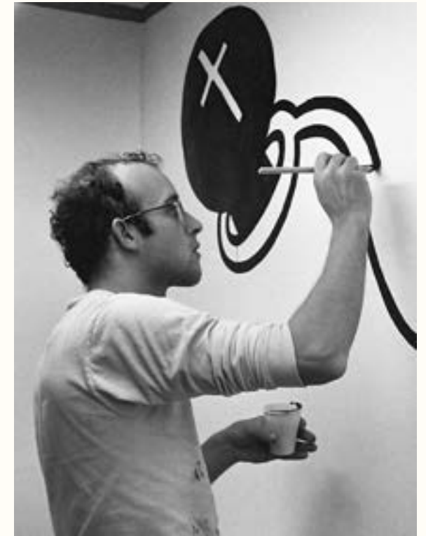
Haring, 1986 at the Stedelijk Museum, Amsterdam Photograph: Nationaal Archief

Haring, 1984, Photograph: Stuart William Macgladrie/Fairfax Media via Getty Images