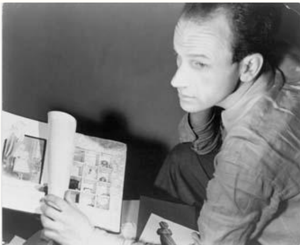
Cornell, ca. 1940

Joseph Cornell Study Center, Smithsonian American Art Museum