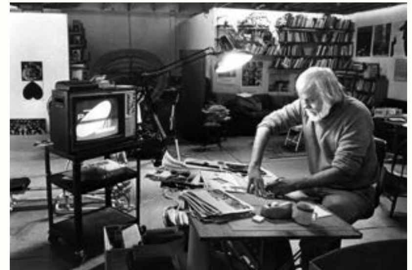
Baldessari in Santa Monica studio, 1986

In 1970, Baldessari embarked on Cremation Project , in which he burned his entire creative output until that point, 13 years of work. Discussing the project with the Tate in 2009, he remembers feeling like he “was drowning, inundated by paintings. I was getting more and more doubtful that only painting was art. The fun of it was doing it, and I thought I don’t really have to own these things, nobody’s ever going to buy them.... Then I thought about the idea of my work as a cycle – an eternal return – so all these materials, pigments and canvas that came out of the ground would return to it. It was a body of work, and I said what if these works are me, and so I’ll cremate them literally as a body.”