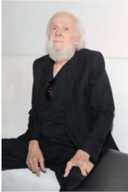
Baldessari, 2015