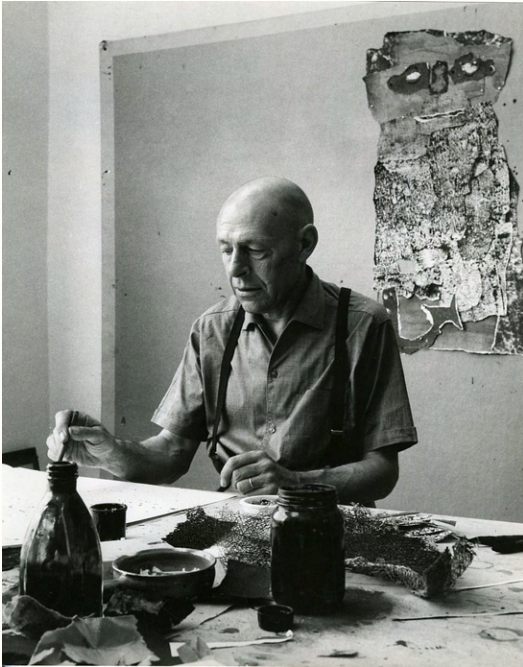
Dubuffet, 1960, Photograph: Paolo Monti/BEIC

Fondation Jean Dubuffet : biography, artworks, exhibitions, publications, and press.