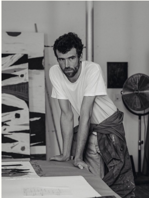
Ancart, 2016