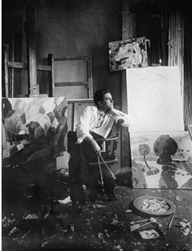
Picabia in atelier ca. 1910

Digital archival copy of the Guggenheim's seminal 1970 retrospective .