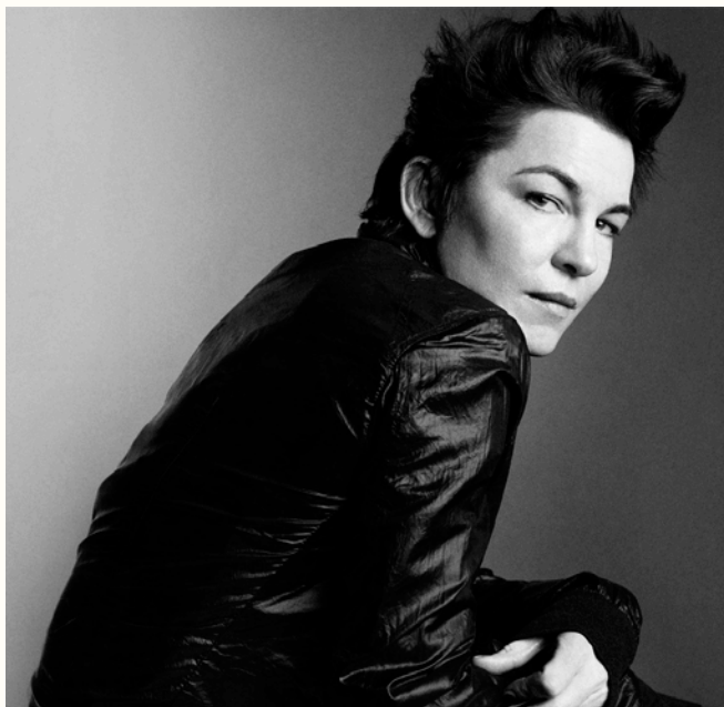
Peyton, 2018

2008 also saw Peyton’s first retrospective tour internationally, at the New Museum in New York followed by The Walker Art Center and Whitechapel Gallery in London.