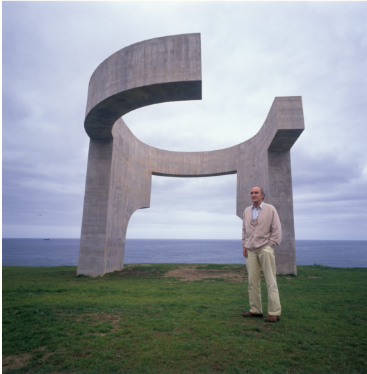
Chillida

Read an exhibition review of Chillida's work held at Sidney Janis Gallery in 1989, published in the New York Times.