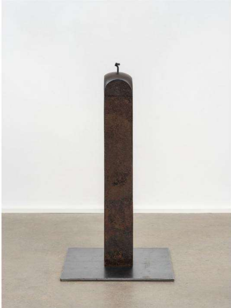
Eduardo Chillida (Spanish, 1924-2002) Saludo a Giacometti (Salute to Giacometti) , 1992 Steel