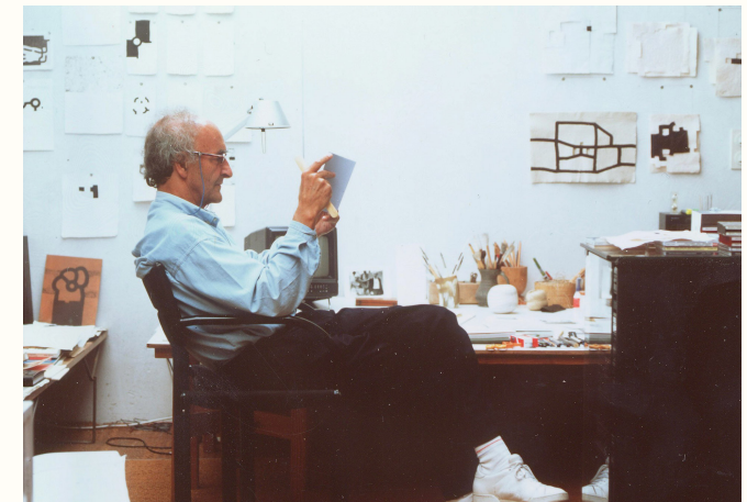
Chillida in his studio

Kunsthalle Krems installed Eduardo Chillida: Gravitation in 2023, the first comprehensive monographic exhibition of the artist's work in Austria.