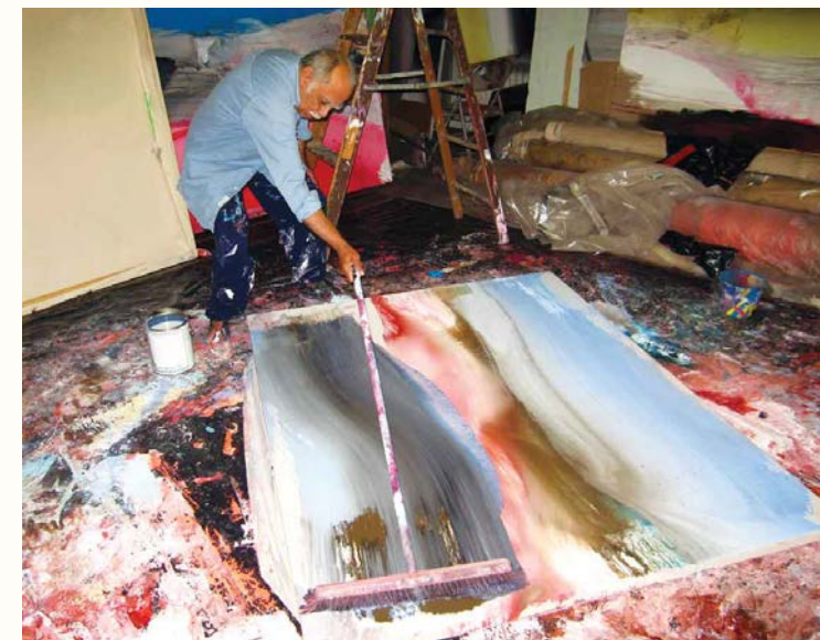
Clark, ca. 2012

In 2019, Hauser & Wirth commemorated the gallery’s representation of the Clark’s estate with an exhibition of paintings made between 2000 to 2013. They followed in 2020 with a showcase of the artist’s pioneering era in abstraction from the 1960s through the 1980s.