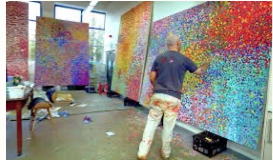
Hirst at work in his London studio, 2017

Hirst's most recent work was inspired by frontline workers during the COVID-19 pandemic and goes to support NHS Charities. While in quarantine, he took to Instagram to answer questions directly from his followers.