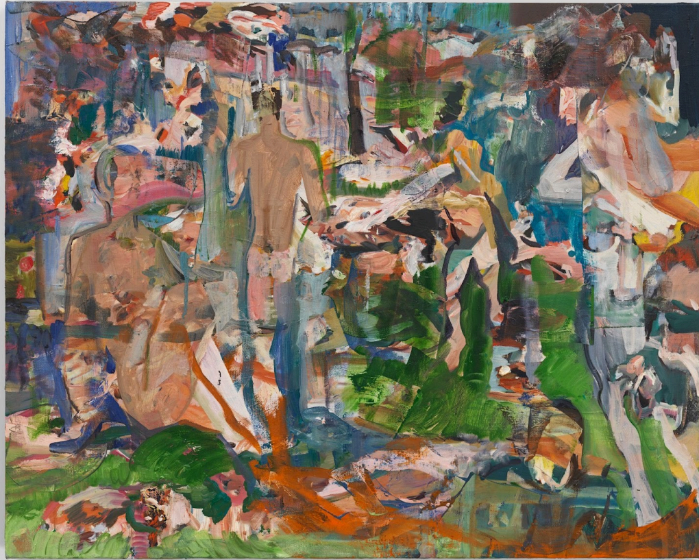
Cecily Brown (British, b. 1969) The Englischer Garten , 2018-2021 Oil on linen