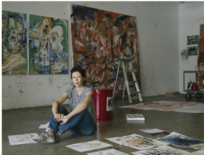
Brown, 2016

“I never think of painting as a cathartic thing, but I definitely think it’s a way of processing things...the way I see the world is fragmented. Recently I’ve been thinking of it more like shattered, everything is splintered,” Brown explained in a video profile for the 2018 Louisiana Museum exhibition, Where, When, How Often and with Whom . Brown discussed the triptych , made in 2017 and partially inspired by real world events, for which the show was titled.