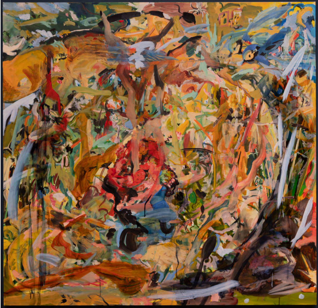
Cecily Brown (British, b.1969) Thrice Happy Green , 2019-20 Oil on linen