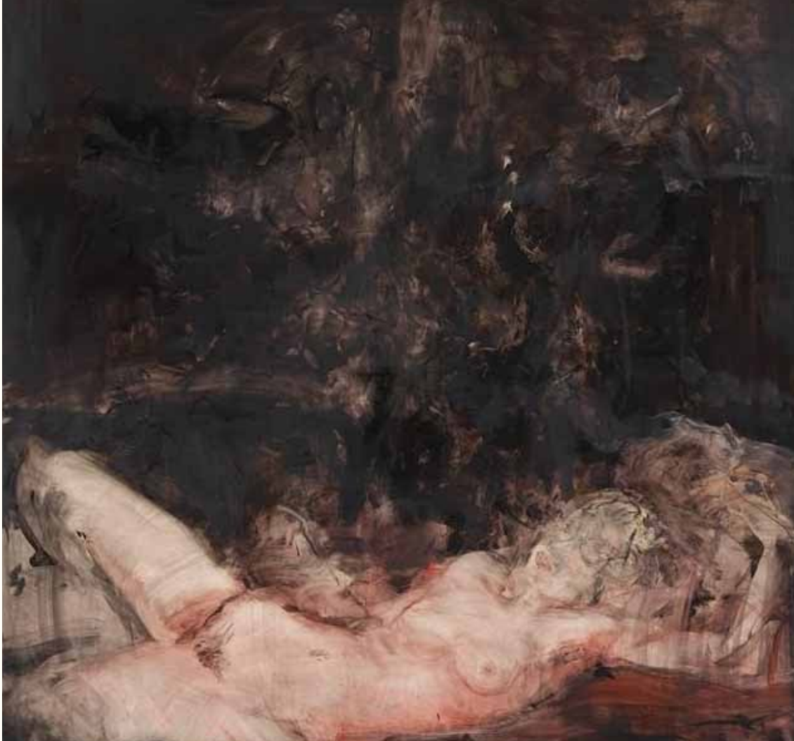
Cecily Brown Sentimental Fool , 2004 Oil on canvas