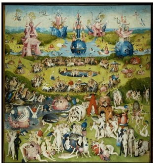
Hieronymus Bosch The Garden of Earthly Delights (detail), 1490-1500 Oil on oak panel Museo del Prado, Madrid