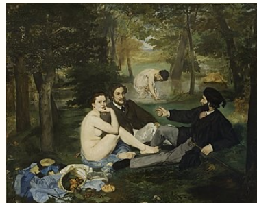
Édouard Manet Le Déjeuner sur l'herbe ( Luncheon on the Grass ), 1863 Oil on canvas Musée d'Orsay, Paris