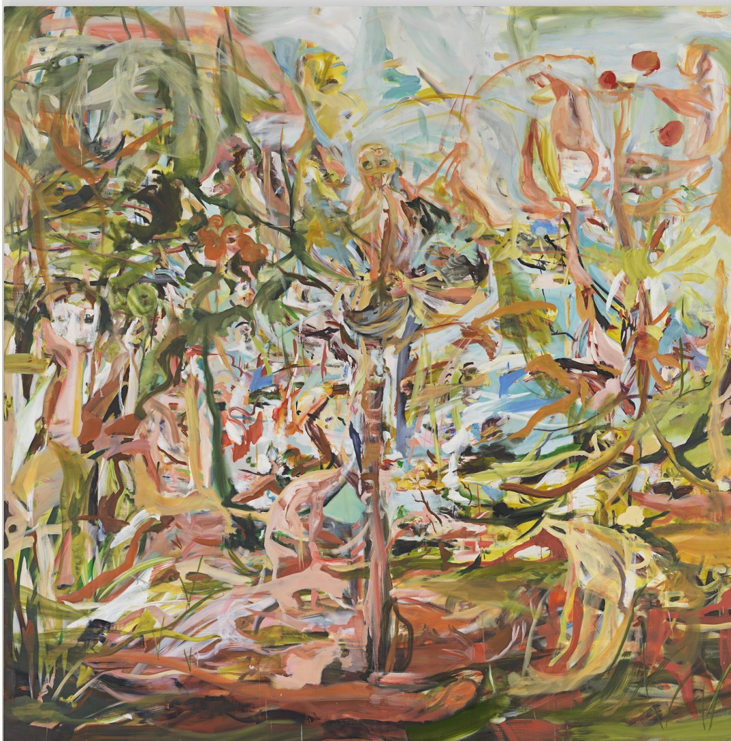
Cecily Brown (British, b. 1969) The Demon Menagerie , 2019-20 Oil on linen