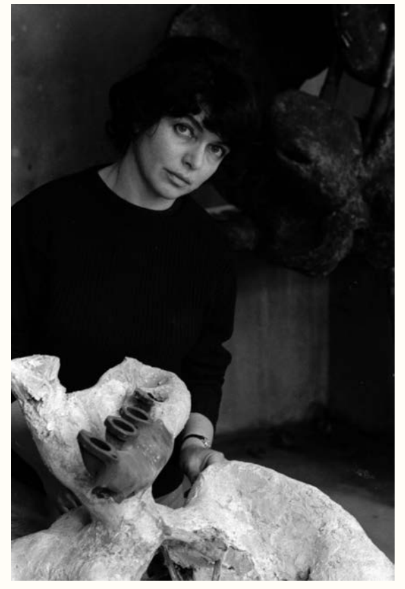
Szapocznikow, Paris, 1964

<u>The Guardian</u> honored Szapocznikow with a thoughtful and penetrating profile of her life and work in 2017 in conjunction of 2018 exhibition, <u>Alina Szapocznikow: Human Landscapes</u>, the first retrospective in the UK, at The Hepworth Wakefield in Yorkshire.