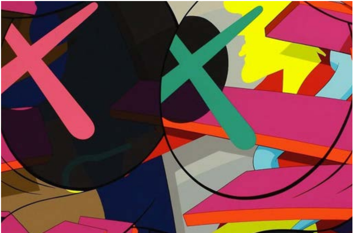
x's and 3d rectangles detail example. © KAWS