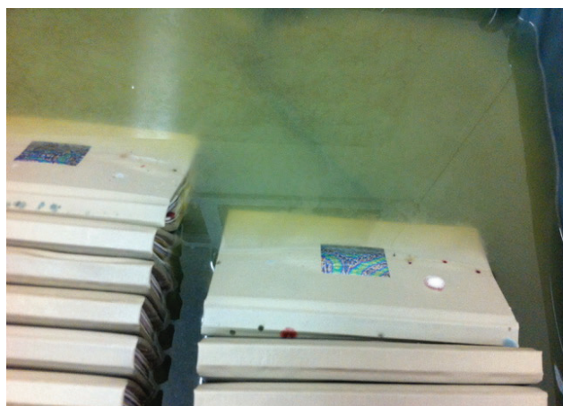
Left and above left Block 2, 2011 Book, 144pp, edition of 250 Letterpress and offset printed on var. papers into a smyth sewn, case binding sitting in a pool of salt water 12 x 21 cm