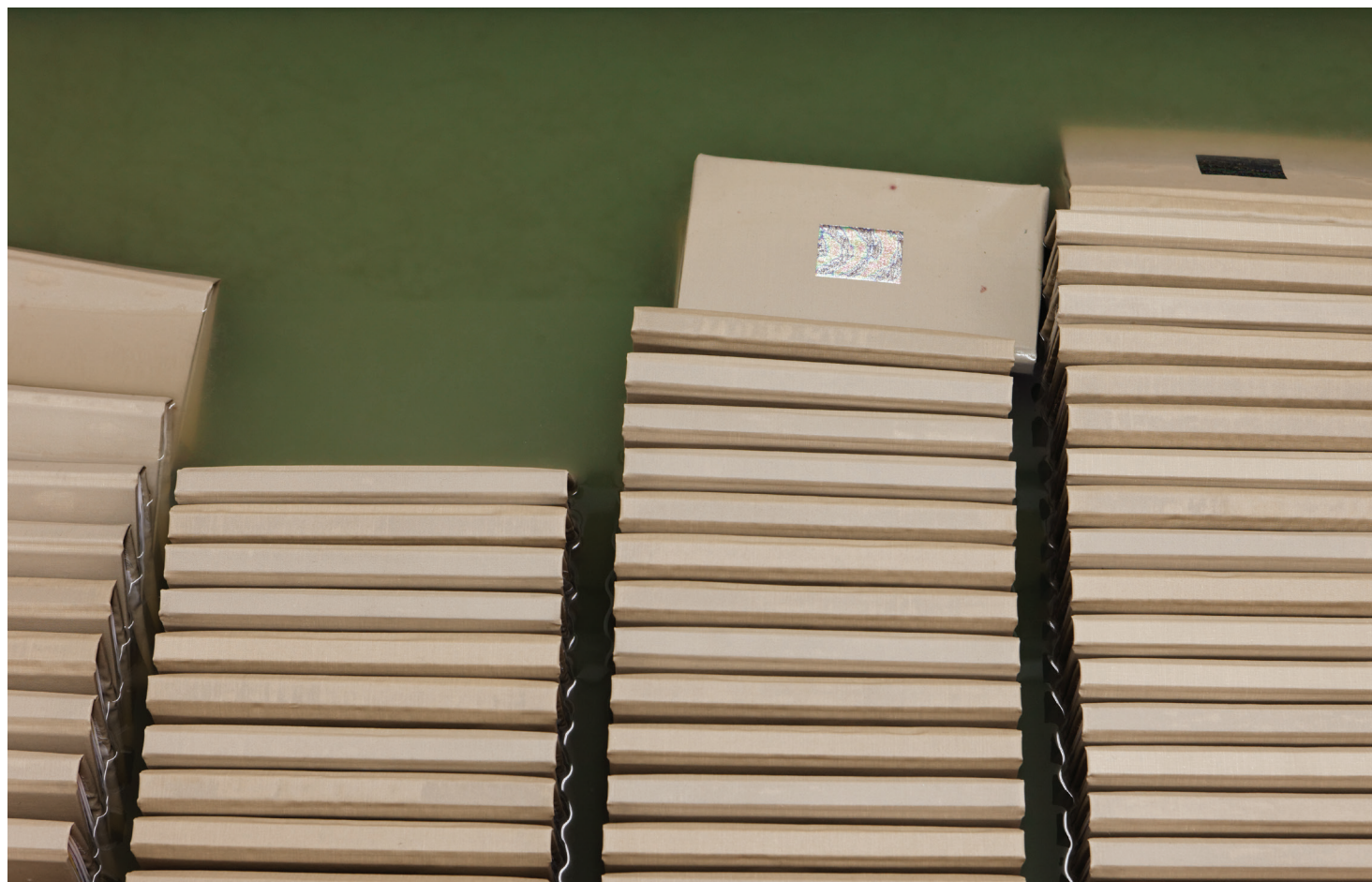
Previous page and above Block 2, 2011 Book, 144pp, edition of 250 Letterpress and offset printed on var. papers into a smyth sewn, case binding sitting in a pool of salt water 12 x 21 cm