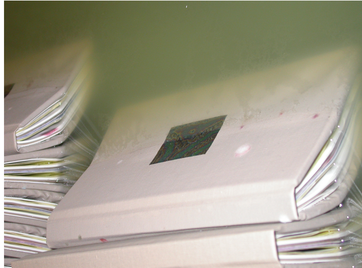
Block 2, 2011