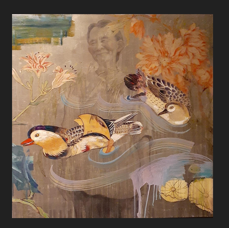
Hung Liu, "Ma II" 2014, mixed-media