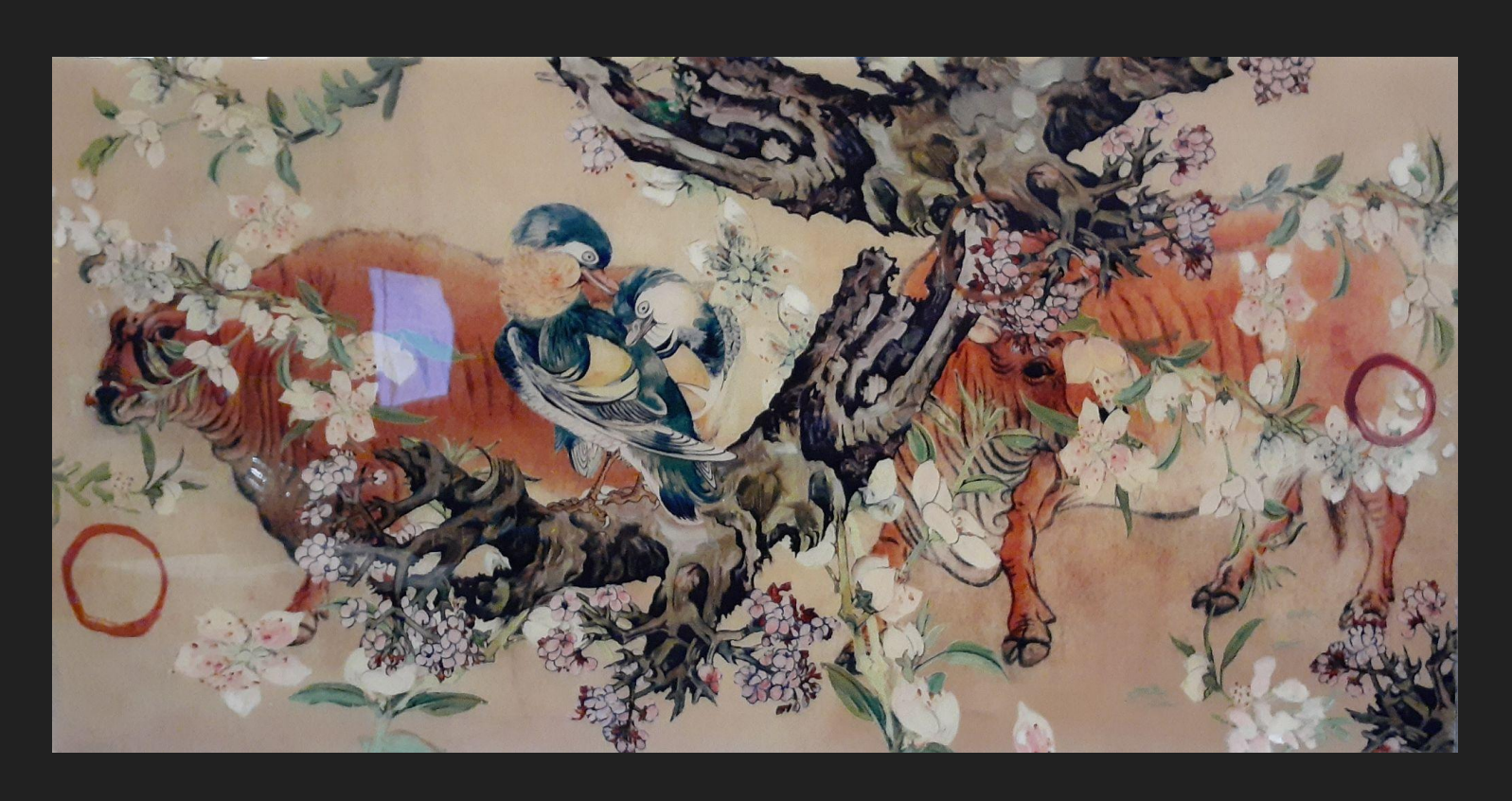
Hung Liu, "Loveland" 2010, mixed-media