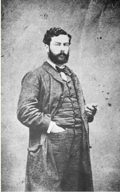
Sisley, 1863