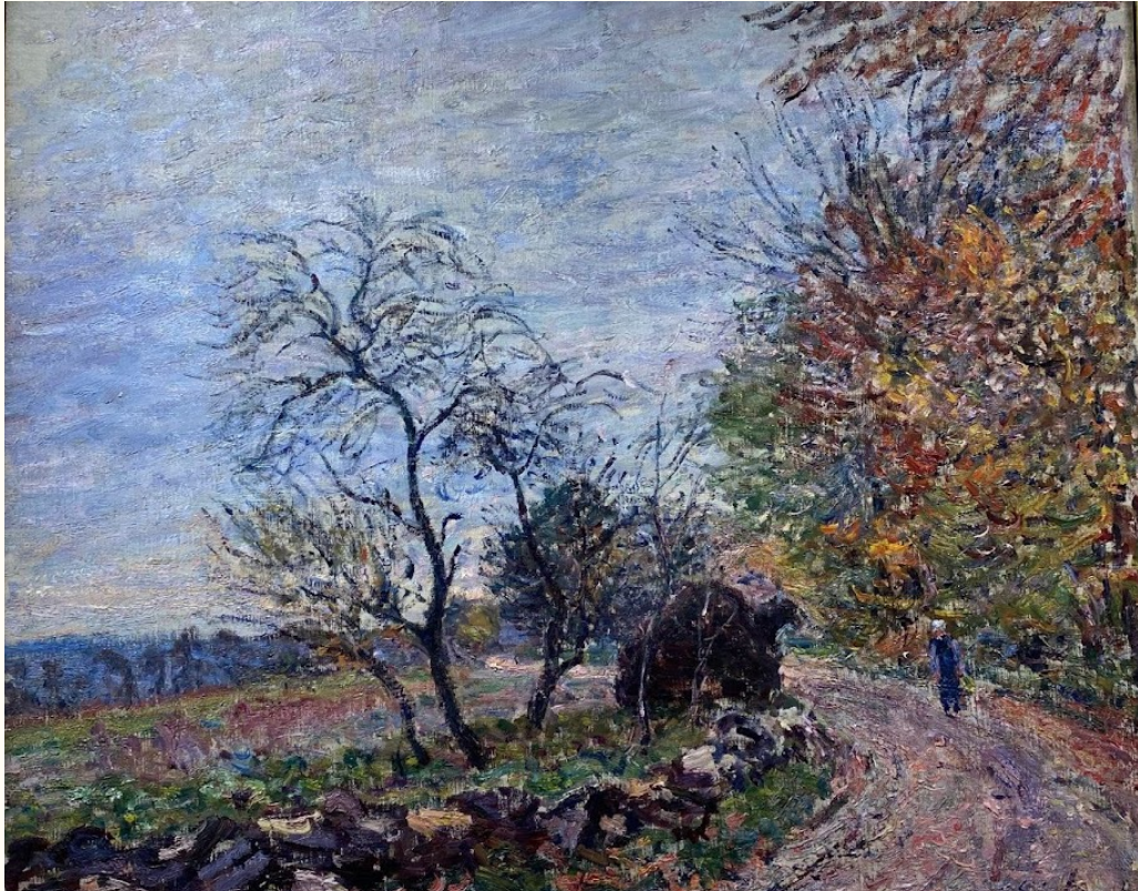
Alfred Sisley (British, 1839-1899) Le Long du Boise en Automne , 1885 Oil on canvas