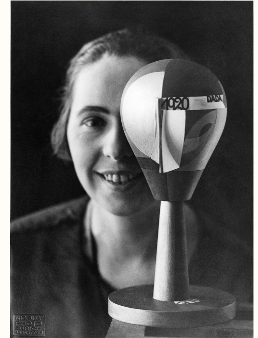
Taeuber-Arp with a Dada Head, 1920

Taeuber-Arp was a co-signer of the Zurich Dada Manifesto in 1916: “Dada is a new tendency in art. One can tell this from the fact that until now nobody knew anything about it, and tomorrow everyone in Zurich will be talking about it. Dada comes from the dictionary. It is terribly simple. In French it means ‘hobby horse.’ In German it means ‘good-by,’ ‘Get off my back,’ ‘Be seeing you sometime.’ In Romanian: ‘Yes, indeed, you are right, that’s it. But of course, yes, definitely, right.’ And so forth.”