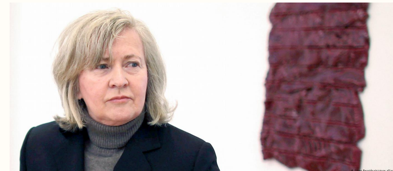
Trockel, ca. 2022

The 2022-2023 solo exhibition at Museum MMK für Moderne Kunst in Frankfurt was a comprehensive retrospective of Trockel’s work since the 1970s and included new works created especially for this display.