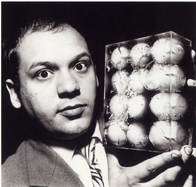
Manzoni, 1960

Manzoni tragically died at the age of 29 from a heart attack in his studio. His impact on contemporary art was not fully realized for decades after his passing. In 1992, Castello di Rivoli-Museo d'Arte Contemporanea held a retrospective. This was followed by one at Serpentine Gallery in London in 1998.