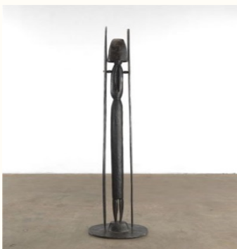
Louise Bourgeois Sleeping Figure II , 1950 Bronze, Edition 3/6 + AP

On display at the JSMA April 13 – July 17, 2022