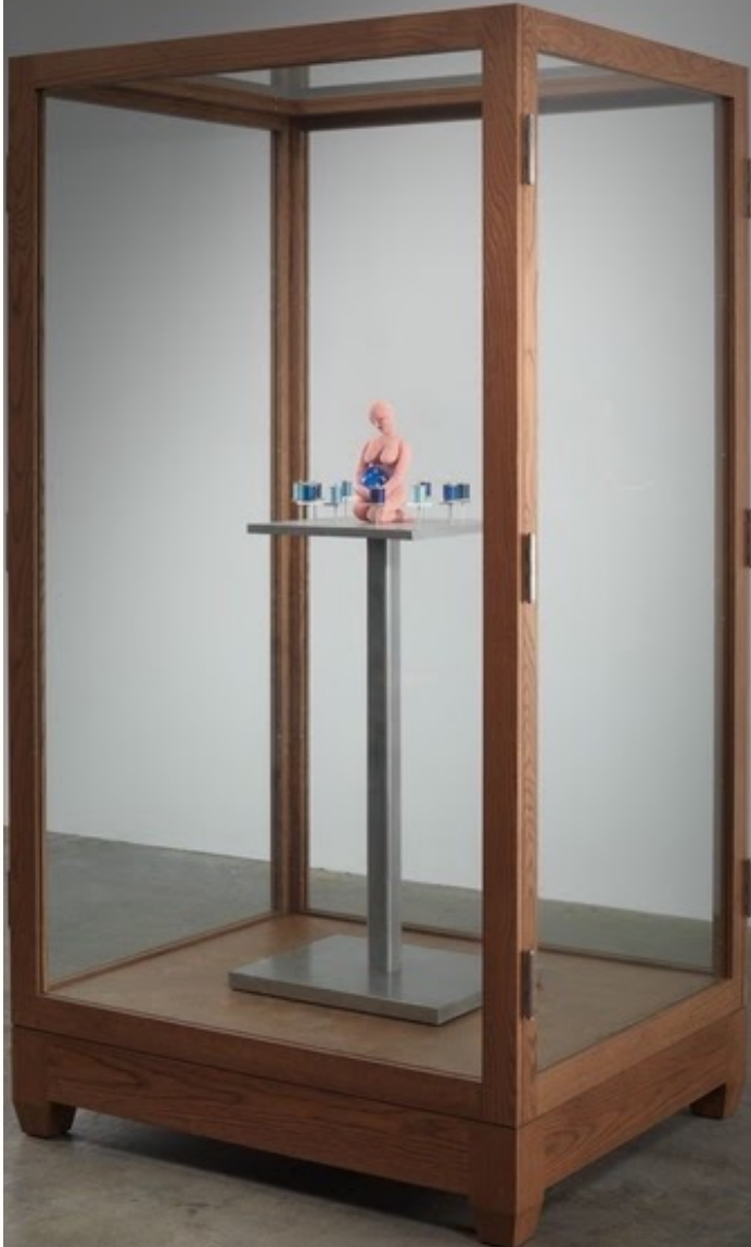
Louise Bourgeois (French-American, 1911-2010) The Eternal Thread is You , 2003 Fabric, thread, glass, white oak, and stainless steel

Private Collection in Los Angeles; L2020:100.1