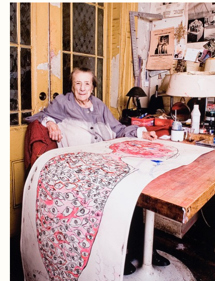
Bourgeois, 2009

Sculpture took pride of place in the Institute of Contemporary Art, Miami’s 2018 survey . Inspired by a work in the museum’s permanent collection, Untitled (2001) , the show explored Bourgeois’ interest in textiles and clothing in three dimensions.