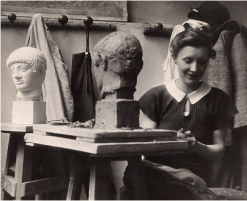
Bourgeois at the Academie de la Grande Chaumière, Paris, 1937