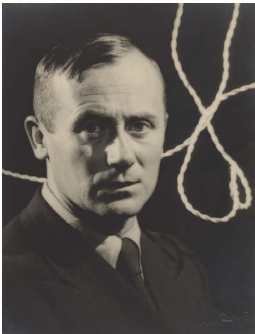
Miró, 1936

Miró returned to MoMA in 2019 for The Birth of the World , titled after the artist's seminal 1925 painting , which explored his burgeoning interest in the relationship between poetry and visual art.