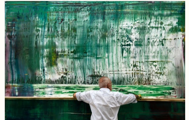
Richter at work, ca. 2011 Still from film, Gerhard Richter Painting

The Met Breuer's 2020 exhibition, Gerhard Richter: Painting After All explores the duality between representation and abstraction that underpins Richter's prolific six-decade career, emphasizing the value of painting as an artistic medium. Digital resources include an exhibition guide and a virtual tour of the galleries, as well as interviews with artists on Richter's continuing influence. Curator's also contributed their insights . "Ultimately, Richter's work is about pictorial and painterly traditions. Standing in front of a painting has more of a singular presence and relevance to our actual living moment than photography will ever have, because photography always marks the instant of passing—the death—of the very moment it records. It is this paradox, burrowed deep in Richter's work, that enables the image to continue to live, to be relevant."