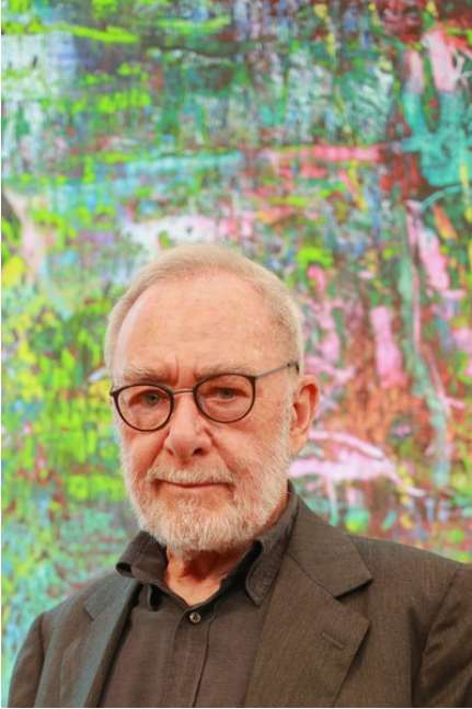
Richter, 2018