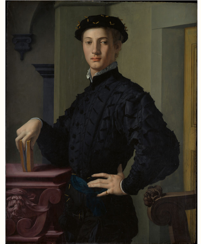
Bronzino Portrait of a Young Man, 1530s

In 2021, The Medici: Portraits and Politics, 1512-1570 was on display at the Metropolitan Museum of Art in New York. Watch a virtual opening of the exhibition and a video about Bronzino's iconic portrait of the poet Laura Battiferri included in the display.